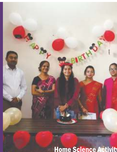
Home Science Activity